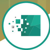
CAFM+ Service Desk